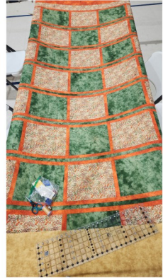
2025 Quilt Raffle

What are you making for Lord's Acre this year??